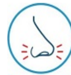
LOSS OF SENSE OF SMELL