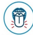
DISTORTION OF SENSE OF TASTE